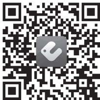
App Download Linkage

Scan the QR code or search "Ewpe Smart" in the application market to download and install it. When "Ewpe Smart" App is installed, register the account and add the device to achieve long-distance control and LAN control of smart home appliances.